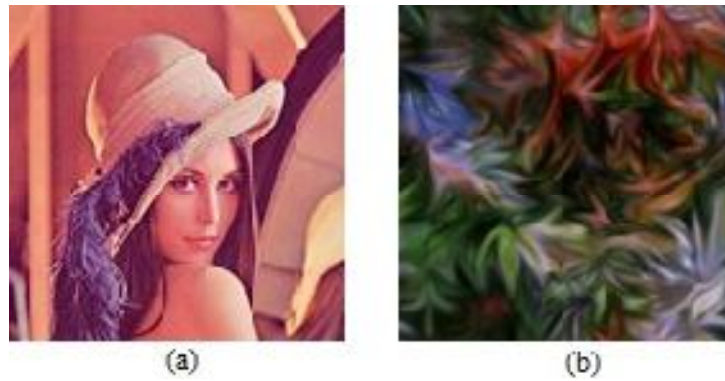
Figure 5: Stego images: (a)Lena as cover image and penguin as the secret image (b) Nature as cover and Black Dragon as the secret image.

The proposed steganography technique is implemented in MATLAB 7.6. The cover images considered are Lena and Nature with dimensions 256x256 and the secret images are Penguin and Black Dragon with dimensions 128x128. All the images under consideration are color images. Figure 3 shows the cover images and Figure 4 shows the secret images. The stego images are shown in Figure 5. Penguin is hidden in Lena and black dragon is hidden in Nature. The extracted secret images are shown in Figure 6.