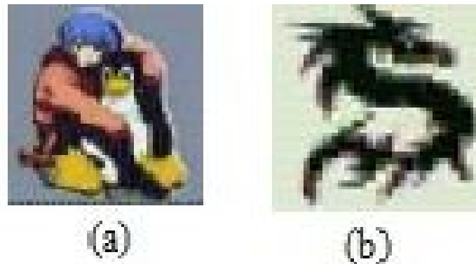
Figure 6: Extracted secret images: (a) Penguin from Lena as the cover image (b) Black Dragon from nature as the cover image.

Table 1 shows the PSNR values in dB of the stego image with respect to cover image. Table 2 shows the PSNR values in dB of the extracted secret image with respect to original secret image. In Table 3 the PSNR values of stego image in our method is compared with PSNR values of other methods which use color images for both cover and secret images.