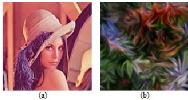
Figure 3: Cover-images: (a) Lena (b) Nature.