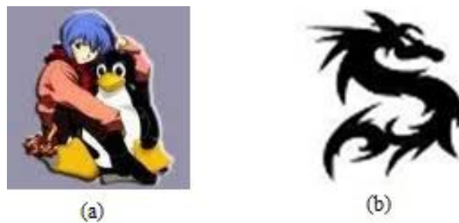
Figure 4: Secret-images: (a) Penguin (b) Black Dragon.