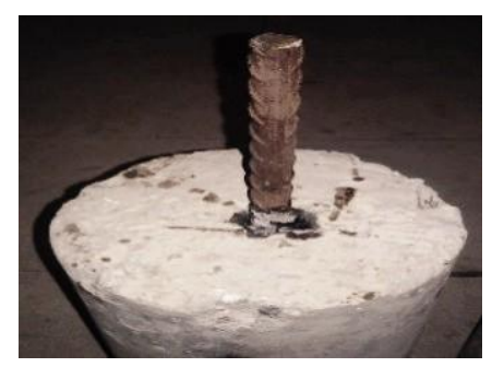
Figure 9a: Pull through failure mode

The results of the pullout test performed on each type of adhesives at two different embedded length for the two bar sizes selected are as presented in Figure 3. No cone failure was observed in any of the pull-out tests conducted on 4minutes and few cone failure were noticed in Hilti and Araldite at a lower embedded depth of 10d. Pull through failure mode was noticed in all the 4minutes samples tested without any crack observed on the concrete (Figure 9a) while the adhesive/concrete interface failures were noticed in the Hilti and Araldite at a high embedded length of 15d (Figure 9b). The most commonly observed is the adhesive/concrete interface failures which were as a result of a stronger bond between the adhesives and bar, this was also common with higher embedded lengths. The bar/coating surface failure was predominant when Araldite was used, this was as a result the presence of more bonding strength between the concrete and the adhesives than it was between the adhessive and the bar.