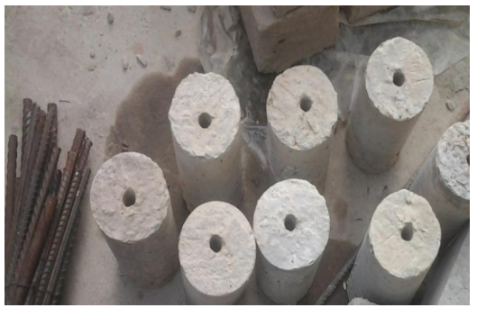
Figure 3a: Holes drilled in concrete cylinders

The pull-out test was carried out on post-installed reinforcements in concrete cylinders at 28 days of curing. The depths of embedment of the reinforcements were varied in multiples of the bar diameters i.e. 10d and 15d. Two different bar sizes; 12mm and 16mm were used for post-installed reinforcement. The diameter of holes drilled at the centres of the concrete cylinders (Figure 3a and 3b) were 4mm greater than the bar sizes installed.