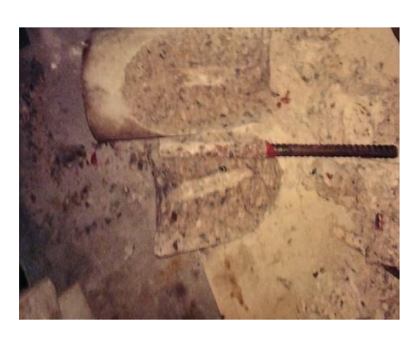
Figure 9b: Adhesive/concrete interface