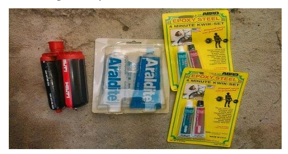
Figure 1: Types of Adhesive used: HIT 500, Aradilte and 4 minutes

were used to glue the anchors to the concrete. The first one is called HIT RE 500 (Adhesive TYPE I) which is an epoxy-based adhesive with a high strength specifically designed to fasten in solid based materials. The second is Araldite (adhesive TYPE II), a slow curing adhesive that has a wide range of application including sealing up ceramics, metals etc. The third is Four minutes (adhesive TYPE III), a rapid curing adhesive that has a wide range of application including sealing up ceramics, metals etc. The third is Four minutes (adhesive TYPE III), a rapid curing adhesive that has a wide range of application including sealingup ceramics, metals etc. These three types of adhesives used as shown in Figure 1 were selected based on availability in Nigeria. Two different ribbed bar diameters of 12 mm and 16 mm were used in this study and were of tensile strengths of 383N/mm<sup>2</sup> and 390N/mm<sup>2</sup> respectively.