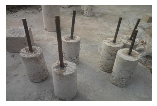
Figure 3b: Reinforcements installed using epoxy-based adhesives as binding agents.

Concrete cylinders were used for this test instead of concrete cubes because the cube size is limited to 150mm and its easier to hold the concrete cylinders in the test machine than to hold cubes for the pull-out test. A universal testing machine was used to perform the pull out tests on the post-installed reinforcements in concrete cylinders. The results of the test were obtained as a printout from the digital display component of the machine. The test was carried out in accordance with the provisions of BS 1881 Part 116:1983 [29]. The bond strength was calculated for each type of adhesive material and embedded length, the values obtained were compared with the minimum standard specifications in Table C1.2 of European Technical Approval manual for good bonding conditions for diamond drilling method (wet cutting system) [30].