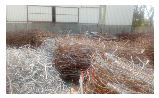
Figure 3. Recycled steel bars arrive in the industrial area of Rageeb

The workers bend these bars by hand to their almost original straight shape using a bending table, also have the sliding bar diameter and are manually sorted by the yield force (grade 40 or grade 60), depending on the bending experience of the bar and the stiffness he feels during bending, as shown in Figures 4 and 5.