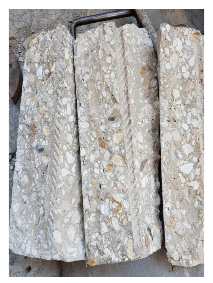
Figure 8. Fresh indentations of deformed steel bar after division

Ultimately, we conclude that used recycled steel bars can be used as construction material with any kind of bonding strength concrete in a safe manner, as both new and used bond strengths were almost standardized.