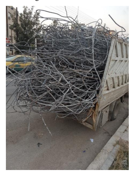
Figure 2. Set of demolition site steel bars

The collected steel bars are transported to the workshop in the Rageeb region of industry. All of them were now tangled and baked. as shown in Figure 2 and 3.