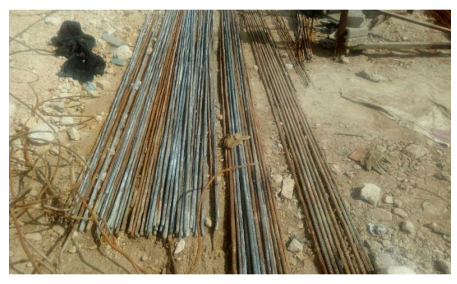
Figure 5. Sorting of steel bars

A survey conducted in year 2000 and replicated in 2012 with demolition contractors reveals that the reused steel bars in superstructures constitute zero percent of the total waste whereas that is approximately two percent of the rebars waste in structures and foundations. Studies in 2016 investigating the mechanical features of bent bars as a factor to limit their reuse, steel bars with different diameters have been bent and their tensile strength tests have been carried out after each bending.