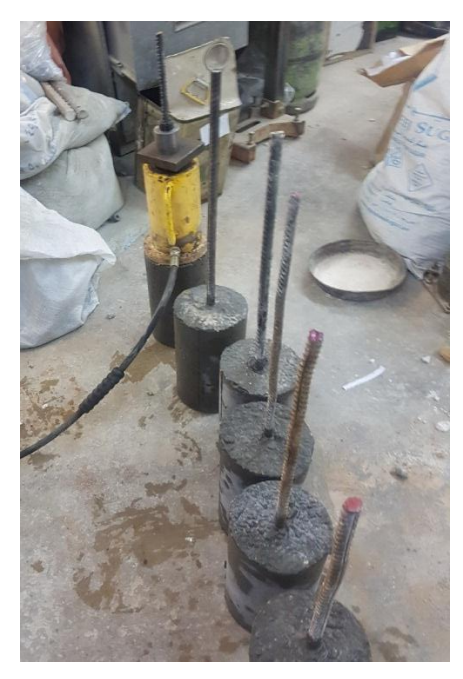
Figure 6. Cylinder in its center with a steel bar undergoing pull-out test

Table 1 and Table 2, respectively for concrete 20-MPa and Table 3 and Table 4 respectively for 35-MPa concrete strength, are shown accordance with BS 5080: part 1: 1993. Table 2 shows new steel bars pullout test for 35-MPa concrete strength