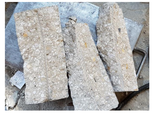
Figure 7. Used after segmentation deformed steel bar indentations

old concrete Derbies to be suitable as building reinforcement steel.