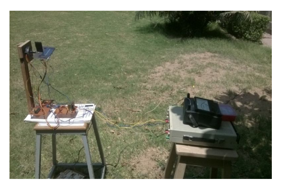
Fig. 2: Designed working Prototype of solar tracker.

The attractive feature of the constructed prototype is the software solution of many challenges regarding solar tracking system. The designed prototype requires only two photo resistors to sense the light, which lessens the cost of the system. Power consumption of the system is negligible.